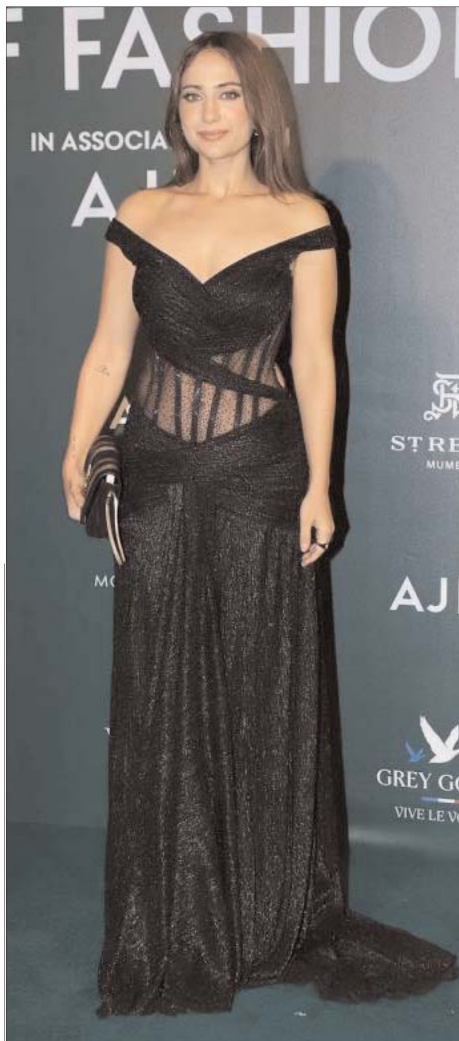
Kusha Kapila is getting prettier by the day. The light-eyed influencer was among one of the best-dressed celebs on the red carpet on Wednesday in her tantalising embellished black corset gown.

Rasha went on to praise her mother, Raveena, for deciding to protect her children from the spotlight, despite being an actor constantly in the public eye.